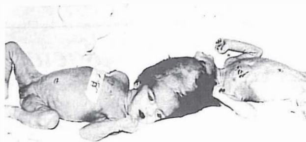
Fig. 2. Conjoined twins: their separation is a formidable challenge and almost impossible.

phenomenon, i.e., all or none law. This signifies that the entire human body functions either as a single workable unit or not at all, therefore the theories emphasizing that death cannot be announced so long as the heart or brain function independently with no coherence or fine adjustment with the rest of the body organs are in fact fictitious and an incorrect assessment of the problem and do not appeal to the mind.