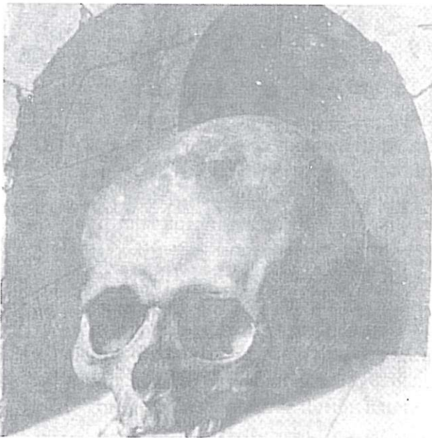
Fig. 4. Is the enigma of the soul more perplexed than euthanasia itself and are things crystal clear at the other end of the dark and horrifying tunnel?

This is not a mathematical question to which we can provide a speedy answer but needs serious sessions and dialogues to clinch the most tangible and plausible answer.