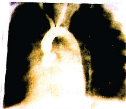
Fig 1: Aortogram in a patient with supravalvular aortic stenosis SVAS showing dilated sinuses of Valsalva and an aortic constriction just above the sinuses.

Cardiac catheterization revealed marked left ventricular aortic pressure gradient which ranged from 164 to 50 mm Hg (median 94.2 mm Hg). Retrograde