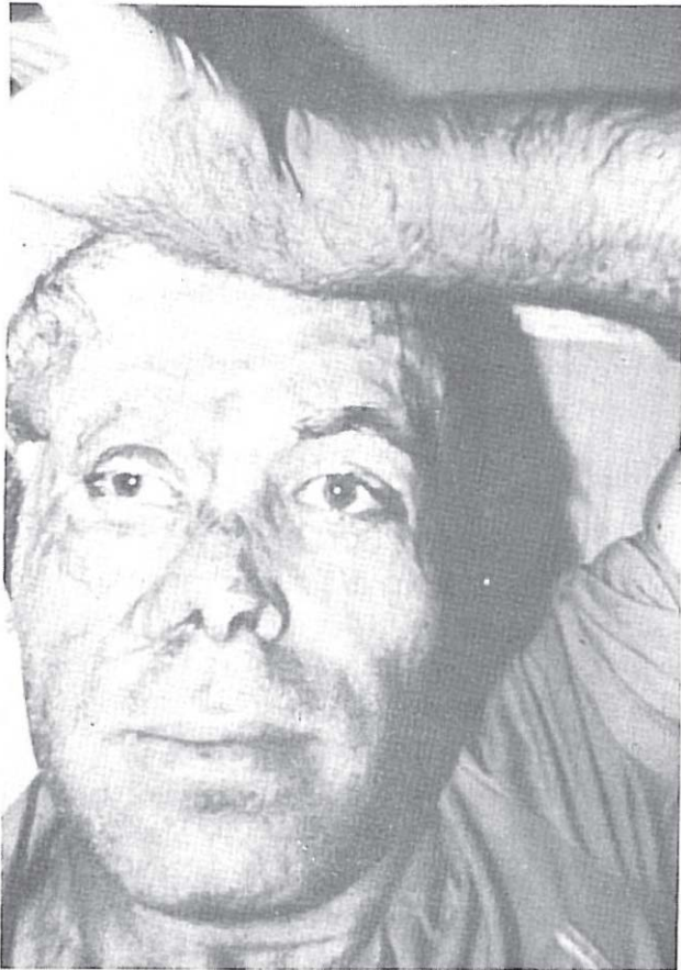
Fig. 4. Patient 1 post-operatively. Note the hairy donor forearm.

A 37-year-old man suffering from post-craniotomy epilepsy sustained full thickness burns to his scalp, forehead, eyelids and nose. An initial attempt to resurface his scalp with a free omental flap was unsuccessful. Subsequently the scalp was reconstructed with a skin grafted latissimus dorsi free flap (Fig. 3). Two years later, reconstruction of the right heminose was performed with a prefabricated grafted radial forearm fascial free flap which was revascularised by an end-to-side anastomosis to the external carotid artery and external jugular vein. The flap was infolded at the alar margin for simultaneous reconstruction of nasal lining. At 18 months follow-up revealed that the flap remained