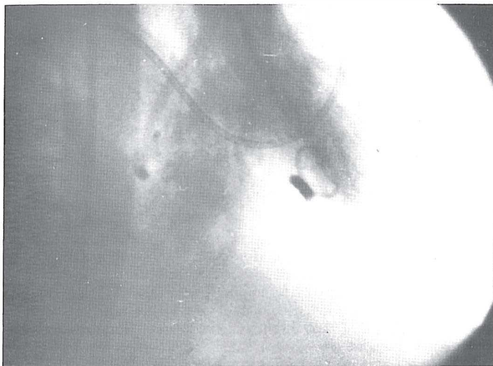
Fig. 1. Left ventricular angiography in right anterior oblique view shows the fragment in the right ventricle.

in all patients to differentiate those with fragments in the pericardium from those with a superimposed shadow on the cardiac silhouette (extracardiac). Catheterization and angiography were done on all patients. The site of shell fragments (all cases were inside the pericardium on or within cardiac structures) were anterior aspect of RV (eight cases), lateral wall of LV (three cases), posterior part of LV (two cases), right atrium (four cases), left atrium (four cases), anterior part of ascending aorta (three cases), left aspect of ascending aorta (one case), main pulmonary trunk (three cases), and inferior surface of the heart (two cases). In three cases the findings of angiography (fragment site) were different from fluoroscopy. One patient showed two plus mitral regurgitation due to chordal laceration and a subclavian arterio-venous fistula was detected in another patient. Coronary angiography was done in all patients and no abnormality was demonstrated.