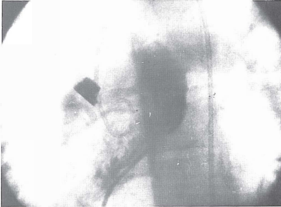
Fig. 2. Left ventricular angiography in left anterior oblique view shows a large fragment in the right atrium.

not successfully treated. 4 Lacerating or penetrating wounds frequently result in immediate hemorrhage of varying magnitude. The severity of the hemorrhage and whether it is intra- or extrapericardial determine the clinical picture and dictate the requirement of therapy. Where there is intrapericardial hemorrhage with a sealed pericardial wound, cardiac tamponade is the major threat; 6 whereas when the pericardial wound is open and bleeding occurs freely into the pleural space, loss of circulating blood volume is the major danger. All of our patients were in a relatively stable situation at the time of admittance due to an average lag interval of five days from injury at the front. That is why we call it "delayed evaluation." The treatment of these lesions, when they are manifested with massive and or continuous intrapericardial hemorrhage, is immediate surgical repair which appears to be the treatment of choice for all penetrating cardiac wounds. Pericardiocentesis should be used in patients with cardiac tamponade only to provide time for a safe operation. Pericardiocentesis as a mode of treatment is not accepted because in most cases thoracotomy reaches a pericardium filled with large clots which renders pericardiocentesis ineffective and continued bleeding is a common finding after initial pericardial aspiration.