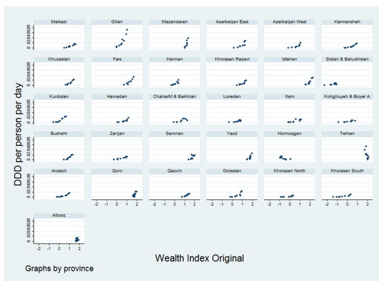
Fig. 2. Scatterplot for WI vs. DPD at provincial level