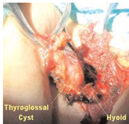
Fig. 3. Sistrunk's procedure.

The incidence of thyroglossal duct cyst carcinoma varies from 0.7 to 1% of thyroglossal duct cysts [5,14,15]. The most common symptom is the presence of an anterior neck mass indistinguishable from those of thyroglossal duct cysts [4,6,12]. However, neoplasia must be suspected in cases of thyroglossal duct cyst with recent changes in clinical features. Imaging tests (ultrasound, computed tomography) do not allow a preoperative diagnosis and fine needle aspiration yields a correct result in only 66% of the cases. The histological diagnosis of thyroglossal duct cyst carcinoma requires the presence of