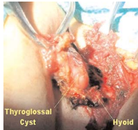
Fig. 3. Sistrunk's procedure.

The incidence of thyroglossal duct cyst carcinoma varies from 0.7 to 1% of thyroglossal duct cysts [5,14,15]. The most common symptom is the presence of an anterior neck mass indistinguishable from those of thyroglossal duct cysts [4,6,12]. However, neoplasia must be suspected in cases of thyroglossal duct cyst with recent changes in clinical features. Imaging tests (ultrasound, computed tomography) do not allow a preoperative diagnosis and fine needle aspiration yields a correct result in only 66% of the cases. The histological diagnosis of thyroglossal duct cyst carcinoma requires the presence of