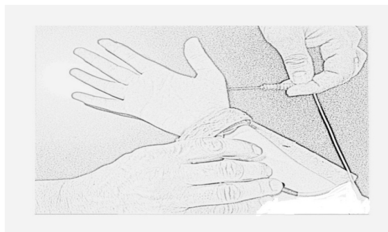
Fig. 2. Motor Evoked Response from APB