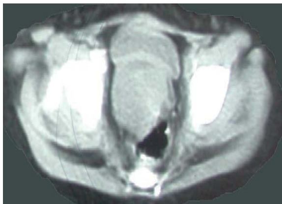
Fig. 1. Contrast – enhanced CT of pelvis showing tumor in vagina.