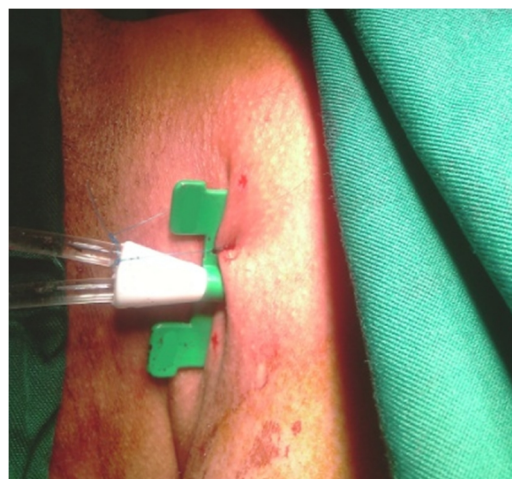
Fig. 4. Sutured to the eyes of catheter so it is strongly embedded

In case of any complication other than infection, catheter was removed and the patient excluded from the study. Patients regularly came to hospital for dialysis session and surgery consultation were interviewed for probable catheter infection. Systemic infection was considered if the patient developed fever, chills, leukocytosis or local erythema. In these cases blood culture was carried out, and in positive cases, the patient was diagnosed with catheter infection and catheter was removed and treatment with broad spectrum antibiotics ensued. A check list made for each patient and demographic data, examination and laboratory data were filled out.