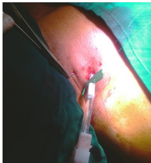
Fig. 3. A fold of skin above the catheter