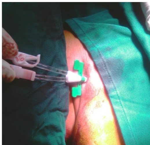
Fig. 1. Catheter embedded in place