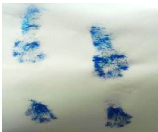
Fig.2. A rabbit's footprints 8 weeks post-surgery