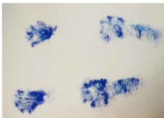
Fig. 1. A rabbit's footprints before the implementation of the experimental methods.

On the other hand, the motor recovery of group 2 was significantly different in the first week compared to those