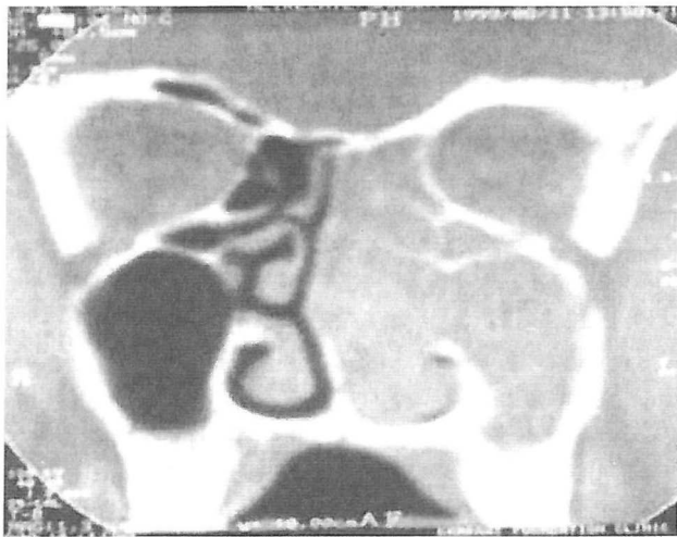
Fig. 1. Preoperative coronal CT scan.

Endoscopic resection was performed under general anesthesia. The nose was prepared using gauze soaked in