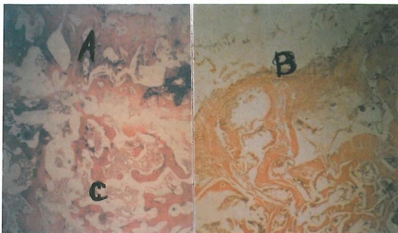
Fig. 3. Histomorphological changes in group III animals. (H&E \times 320). A) Matured osseous trabeculae. B) Fibrous capsule, periosteal layer. C) Newly formed bone marrow.