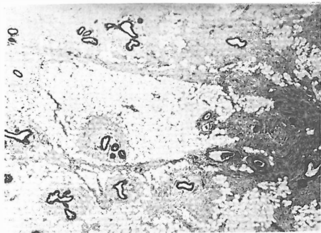
Fig. 2. Histologic specimen shows an adenolipomatous hamartoma with predominant fatty component, which created the appearance of mixed density in mammography (Hematoxylin-Eosin, \times 58 ).

The pathologist should be alerted to the radiographic diagnosis when these lesions are removed, as they are sometimes difficult to remove intact, and a correct histologic report may not be made. 10 Indeed a correct diagnosis of hamartoma relies on clinical, radiological and pathological criteria.