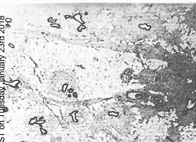
Fig. 2. Histologic specimen shows an adenolipomatous hamartoma with predominant fatty component, which created the appearance of mixed density in mammography (Hematoxylin-eosin, ×58).

Downloaded from www.ijir.iums.ac.ir at 23:41 IRST on Tuesday, January 23rd 2018