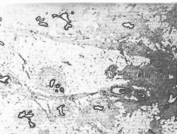
Fig. 2. Histologic specimen shows an adenolipomatous hamartoma with predominant fatty component, which created the appearance of mixed density in mammography (Hematoxylin-Eosin, ×58).

The pathologist should be alerted to the radiographic diagnosis when these lesions are removed, as they are sometimes difficult to remove intact, and a correct histologic report may not be made. 10 Indeed a correct diagnosis of hamartoma relies on clinical, radiological and pathological criteria.