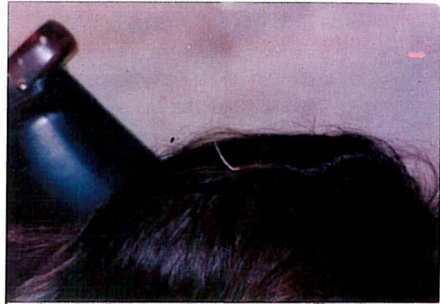
Fig. 1. Trichofolliculoma. The white tuft of hairs is shown.