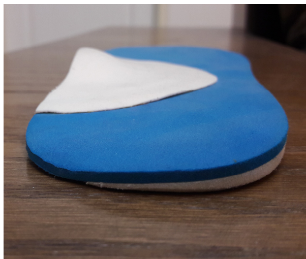
Fig. 1. Lateral Wedge Insole for the Right Foot

An examiner assessed all individuals at baseline and