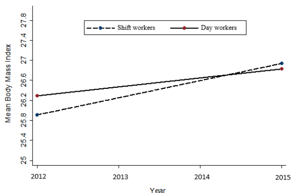
Fig. 2. Growth trajectories of BMI across schedule groups among staff in the period of four years based on estimates of multiple latent growth modeling parameters.

with p = 0.008 for day workers, and variance of 1.73 with p < 0.001 for shift workers). Moreover, the smaller negative correlation for the shift workers indicates that the higher initial levels of BMI in the shift workers was related to a greater reduction in BMI over time than the day workers. Figure 2 displays the trend of estimated mean BMI, separately in the day and shift workers during years under study.