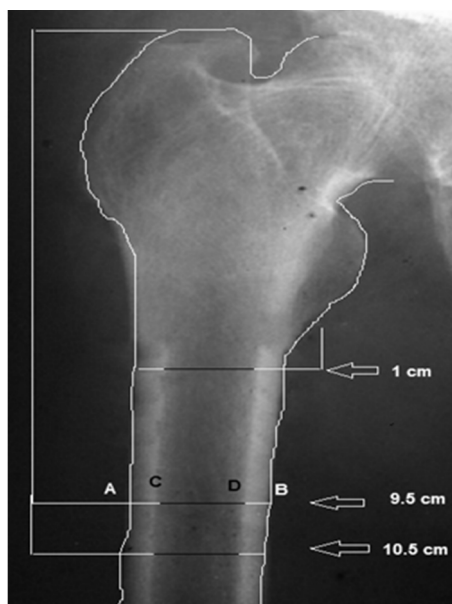
Fig. 2. A plain pelvic Xray shows measurements were obtained at 9.5 cm and 10.5 cm from the tip of the greater trochanter and 1 cm of lesser trochanter. Cortical thickness was calculated by subtracting the medullary diameter from the femoral shaft diameter (AB - CD). The cortical thickness ratio was defined as the percentage of the cortical thickness to its femoral shaft diameter [(AB - CD)/AB].

mural shaft were measured in 3.5 and 4 cm of greater trochanter (GT) and 0.5 cm under smaller trochanter (LT) in BMD and in 9.5 and 10.5 cm of GT and 1 cm under LT in plain pelvic graphs (Shimadsu, Japan) according to accommodation of size in this Xray of a patient.