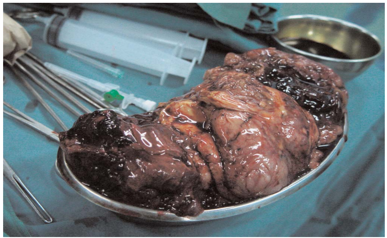
Fig. 3. Liver tissue after resection of the mass.

no wall enhancement in early and delayed phases of imaging. Bilateral pleural effusion with right side dominancy was also noted. Free fluid and intra-abdominal LAP was not seen.