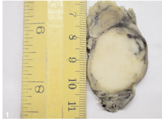
Fig. 1. An enlarged lymph node within the parotid parenchyma.

For definite diagnosis the sections were immunostained by streptavidin-biotin method with the following panel of antibodies: (CD 15, DAKO, 1/100, antimouse), (CD30, DAKO 1/100, antimouse), (CD 45, DAKO 1/100, antimouse), (CD20, DAKO, predilute, antimouse). The classic Reed-Sternberg