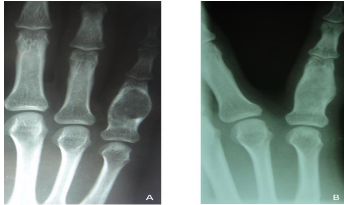
Fig. 1. Enchondroma of proximal phalanx of fifth finger. (A) Radiographic appearance of tumor (B) 8 months after curettage and bone grafting.

fourth to sixth decades, has high histologic grade, apparent cortical destruction, and soft tissue extension [1,2,7-9]. It's proved that chondrosarcoma of the hand is a locally aggressive lesion which in contrast to other anatomic sites, rarely metastasizes, and excellent local control may achieved after recurrence by reoperation [1,7,8,10]. Recently there is a tendency toward more conservative intralesional procedures including curettage (similar to enchondroma) for the treatment of chondrosarcomas [7].