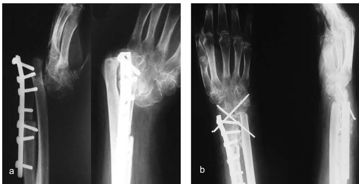
Fig. 2. Case7- 65-year-old male with a stage 3 giant cell tumor of the right distal radius, (a) allograft fracture and joint dislocation. (b) Exchanging the osteoarticular allograft and wrist fixation with pins.

Radiographs showed narrowing of the joint space in all patients, ulnocarpal impaction in thirteen, carpal subluxation in six, formation of osteophytes and subchondral sclerosis in eight, and widening of the distal radioulnar joint in nine.