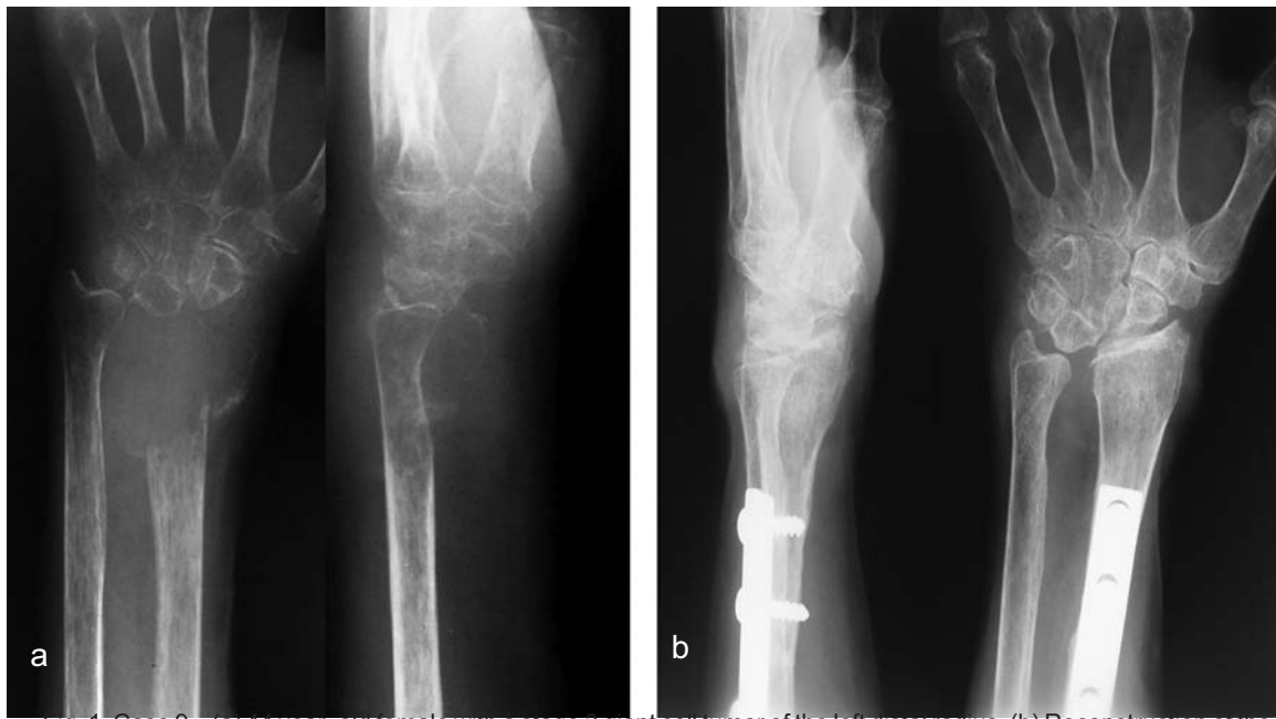
Fig. 1. Case 9 – (a) 44 year-old female with a stage 3 giant cell tumor of the left distal radius. (b) Reconstruction of the resected segment with an osteoarticular allograft, fixed with a dorsal plate.

occasionally limited to the metaphysis, and in only 2 per cent of the patients is it adjacent to an open growth plate. The tumor on occasion invades the articular space, also involving the ligaments and the synovial membrane. Extension to an adjacent bone through the joint occurs in 5 per cent of the tumors. Less frequently, giant cell tumors occur in the vertebrae (2-5%) and in the sacrum (10%) [1].