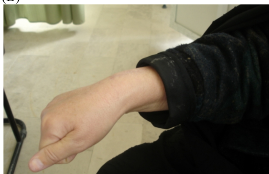
Fig. 4A and 4B. Clinical photo showed that functional improvement after operative treatment.