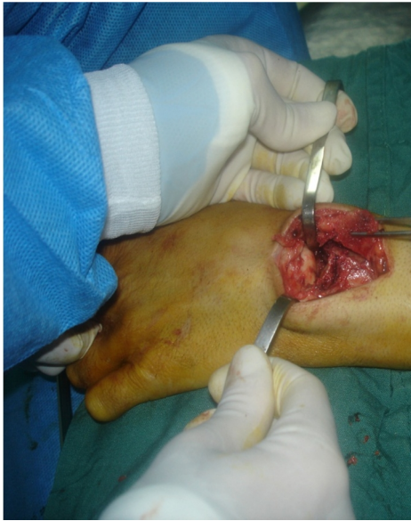
Fig. 1. Dorsal approach was used for osteotomy and fixation in patients with distal radius malunion.