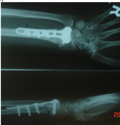
Fig. 2A and 2 B. The patient's; preoperative comparative, Radiographs (A) and postoperative radiographs (B).

previous distal radius fracture with severe malunion, for a period of around two years