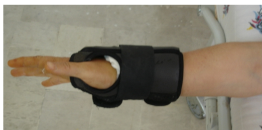
Fig. 3. After 4 weeks plaster slab removal, wrist splint was given for 2 weeks.