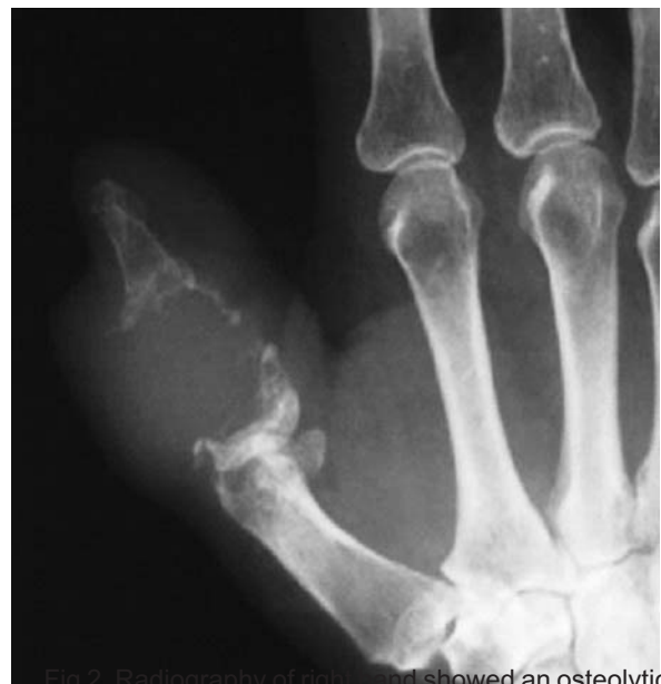
Fig 2. Radiography of right hand showed an osteolytic lesion of thumb proximal phalanx.

and destructive lesion, involving proximal phalanx, and was isointense on T1-weighted images and hyperintense on T2-weighted images. The tissue mass was expanded to the IP joint and dorsal aspect of proximal phalanx, nonetheless technetium-99m bone scan showed a single focal area of mild increase uptake at the right