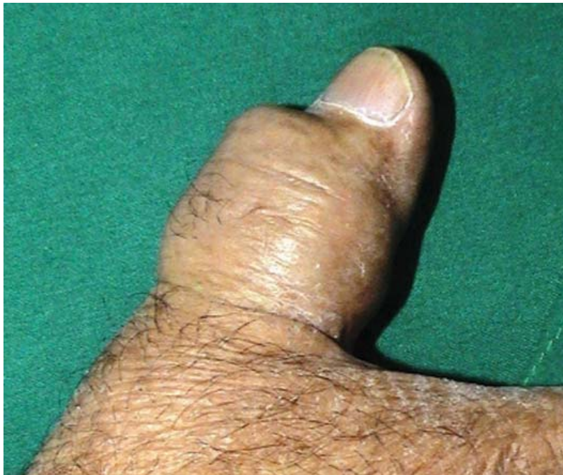
Fig 1. Photography of right thumb, with the lesion.

sented to our department with an enlarging mass on the right thumb. The lesion formed on the dorsal surface of the proximal phalanx, 1 year before the presentation. He had no history of previous trauma or infection. His past medical history consisted a cervical spine fracture, which was treated with spinal fusion 7 years ago. At presentation, the lesion appeared to cover the entire proximal phalanx, which was diffusely swollen (Fig 1). Thus patient had severely limited range of motion for thumb IP joint. The mass was not tender and thumb had normal two point discrimination. There was no alteration in skin or proximal adenopathy. There was no hypercalcaemia or preoperative anaemia and erythrocyte sedimentation rate and C-reactive protein, were within normal limits.