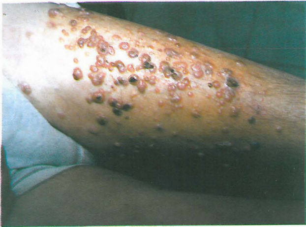
Fig. 1. Zosteriform metastases in a 69-year-old man with malignant melanoma.