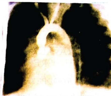
Fig 1: Aortogram in a patient with supravalvular aortic stenosis SVAS showing dilated sinuses of Valsalva and an aortic constriction just above the sinuses.

Cardiac catheterization revealed marked left ventricular aortic pressure gradient which ranged from 164 to 50 mm Hg (median 94.2 mm Hg). Retrograde