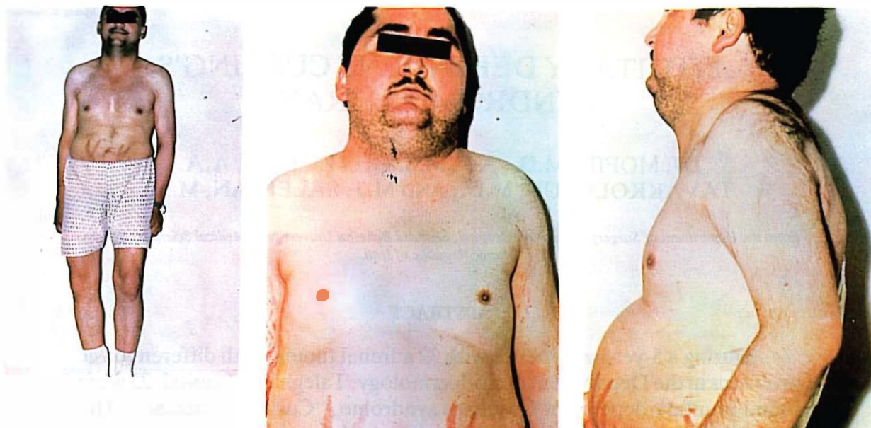
Fig 1. Cushing's syndrome. A: Despite the marked obesity and protuberance of the abdomen, the extremities are thin. B: Lateral view of the same patient.