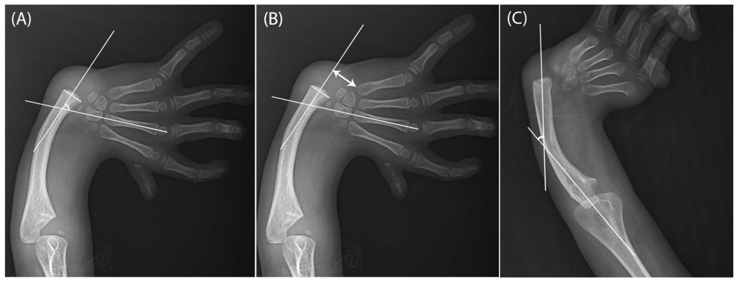
Fig. 1. Assessment of forearm angles based on Manske method; (A) Hand-forearm angle; (B) Hand-forearm position; (C) Ulnar bow

The centralization approach was performed to correct the RCH (Fig.2). The incisions were different, as the surgeries were performed by 3 different hand surgeons. However, the rest of the operations were done in accord-