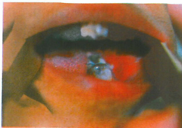
Fig. 3. Bright red buccal mucosal erosions with typical white reticular margins.