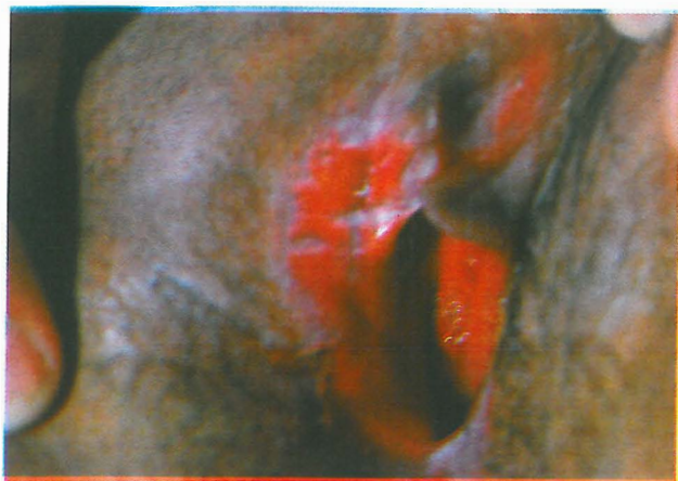
Fig. 1. Vulvo-vaginal erosions of bright red colour with typical white reticular margins.