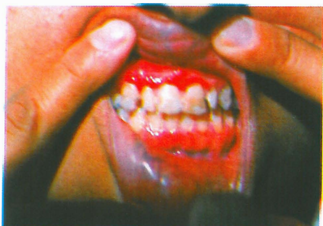
Fig. 2. Bright red erosive gingivitis of upper gums with mild white reticular margins.