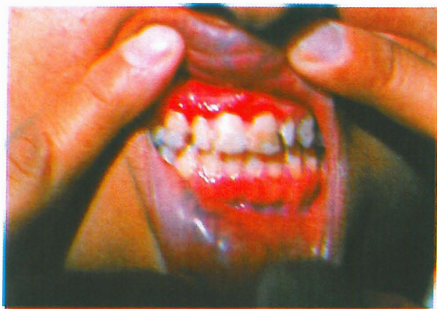
Fig. 2. Bright red erosive gingivitis of upper gums with mild white reticular margins.