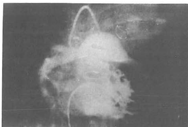
Fig. 4. Right ventricular injection demonstrating valvar and supra-valvar pulmonary stenosis and post-stenotic dilation of left pulmonary artery.

the child was taken to the pediatric surgical intensive care unit. Pathology report of the aneurysm wall was "aneurysm of ductus arteriosus showing cystic mucoid degeneration similar to that of Marfan syndrome".