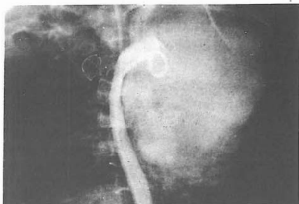
Fig. 5. Injection of dye in descending thoracic aorta revealing opacification of huge aneurysmal mass (RAO view).