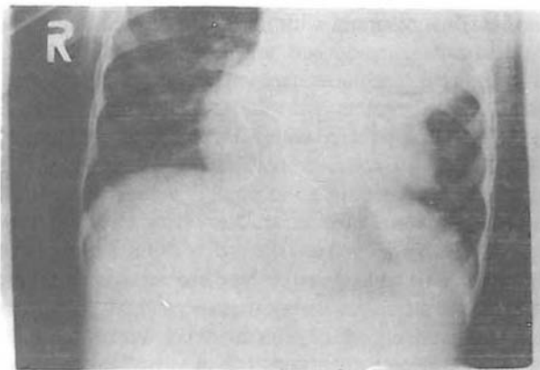
Fig. 1. Chest roentgenogram depicting a huge mass occupying the entire left upper hemithorax.

On physical examination, he was an underdeveloped child. Blood pressure was 120/70 mmHg, heart rate was 100/min, and body weight was 13 kg. He had no chest deformity. A right ventricular heave and an associated thrill were present all across the precordium. On auscultation, a grade III/VI ejection-type systolic murmur was audible at the left and right sternal border. There were diminished