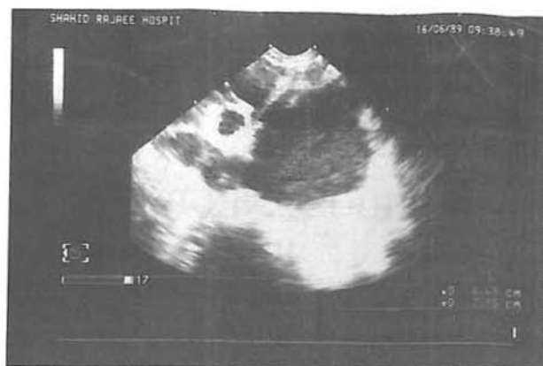
Fig. 2. Echocardiogram (short-axis view) depicting aneurysmal mass adjacent to the descending thoracic aorta and left atrium.

Due to massive size of the aneurysm and associated cardiac anomalies, we obviously chose to approach the lesion via a median sternotomy incision. At operation, a huge, pulsatile mass, 15 cm in diameter, was found compressing the mediastinum and upper lobe of the left lung. After initiation of cardiopulmonary bypass and moderate hypothermia with cold cardioplegic arrest, the right ventricle was opened and prominent muscle bands were resected. The pulmonary valve was severely stenotic and a commissurotomy was done. The ventricular septal defect was then repaired with a dacron patch and the right ventricular wall was repaired with a pericardial patch. Profound hypothermia to 18°C was then instituted and during a brief period of total circulatory arrest, the aneurysmal sac was widely opened and the orifice of the aorta sutured from within with pledgeted prolene mattress sutures. There was no clot inside the aneurysmal sac, and the pulmonary end was not open, which probably led to formation of the aneurysm. Excess aneurysm wall was excised as far as adhesion of adjacent structures would allow, and rewarming and weaning from bypass was done as routine. After closure,