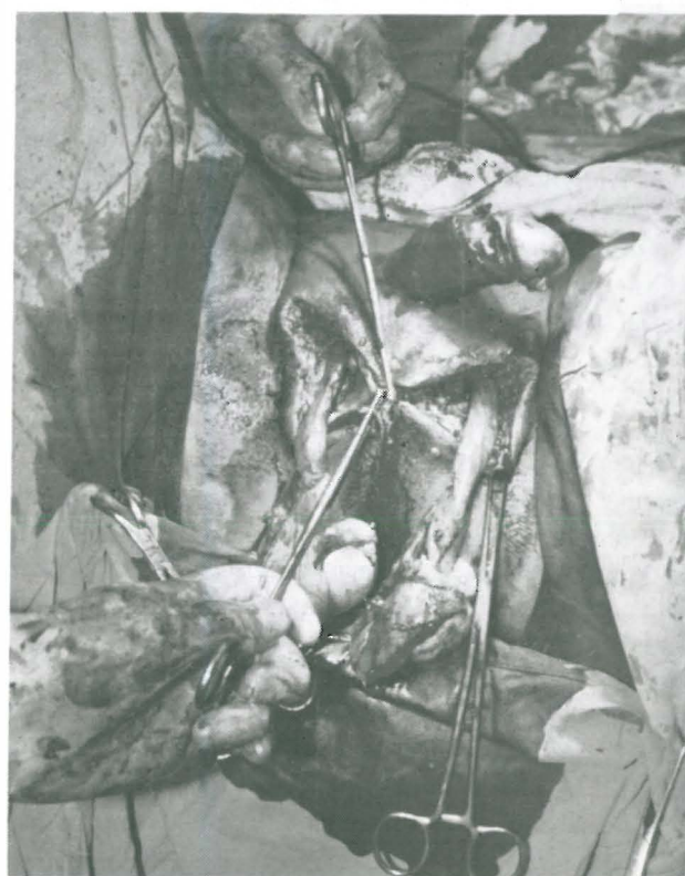
Figs. 3,4. Intra-operative view.

Both testicles and spermatic cords are secured during excision of lymphedematous tissues, and button hole for the penis with posterior U-shaped flaps are shown.