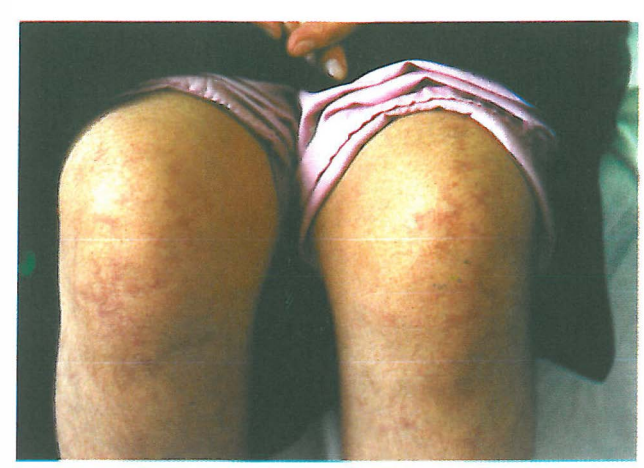
Fig. 2. Livedo reticularis on the knees.