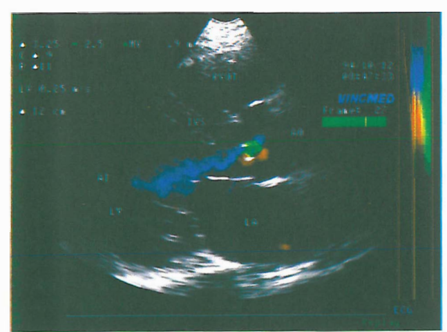
Fig. 4. Parasternal long-axis view; arrow denotes AI.