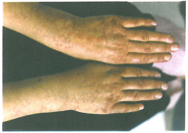
Fig. 1. Livedo reticularis on the hands and forearms.

The chest roentgenogram revealed a moderately increased cardiothoracic ratio in the long axis. The ECG showed a normal sinus rhythm and some evidence of LVH. Echocardiography showed a moderate degree of aortic valve insufficiency (Fig. 4), and the three cusps of the aortic valve were thickened, and showed incomplete coaptation in diastole (Fig. 5). The mitral valve leaflets showed diastolic fluttering and were mildly thickened, with no restriction of motion or