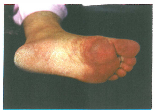
Fig. 3. Livedo reticularis and hyperemia.

insufficiency. There were not any visible vegetative lesions, and the LV was mildly dilated with symmetrically increased wall thickness and an EF of about 50-55 percent.