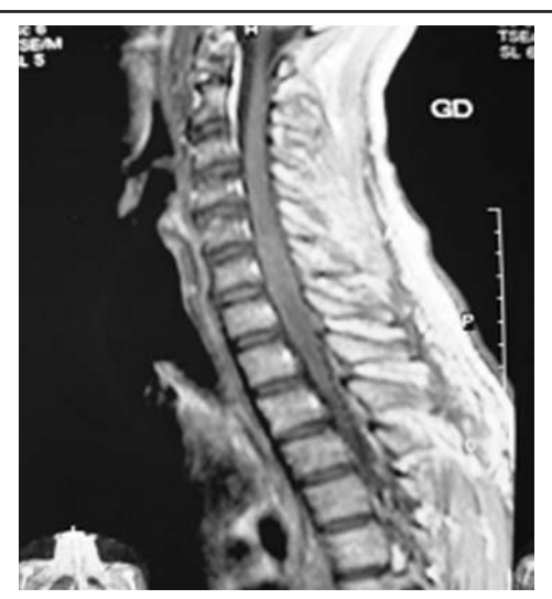
Fig. 2. T1 MRI with contrast shows no enhancing cord expansion in C5-T2 level.

He walked using a walker seven months after his injury.