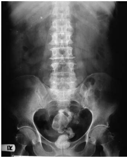
Fig. 1. An oval calcified opacity in right iliac fossa region on plain abdominal X-Ray.