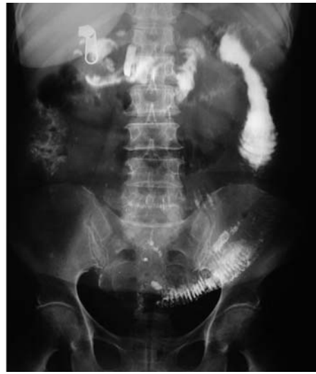
Fig. 2. Post ERCP biliaryenteric fistula on plain abdominal X-Ray.

licit drug consumption. She sought medical care at a local medical centre in her hometown where primary diagnostic evaluations were performed, then she was referred to our hospital for advanced diagnostic and therapeutic evaluation.