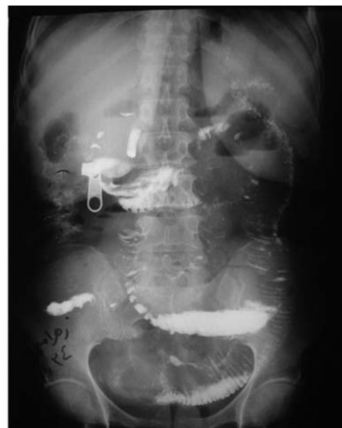
Fig. 3. Post ERCP with air fluid level on plain abdominal X-Ray.

Unfortunately, as diagnostic evaluation was being done, patient's general condition worsened. Gradually, she lost orientation to time, place and person. A neurological consultation was sought, and an extensive ischemic cerebrovascular accident was diagnosed. She was transferred to the intensive care unit (ICU) of the hospital, and