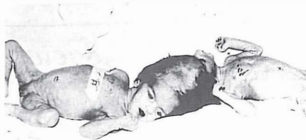
Fig. 2. Conjoined twins: their separation is a formidable challenge and almost impossible.

The most glaring example of voluntary euthanasia is suicide or self murder. According to Islamic tenets this form of voluntary euthanasia violates God's commandments and is therefore forbidden. However if life becomes monotonous,