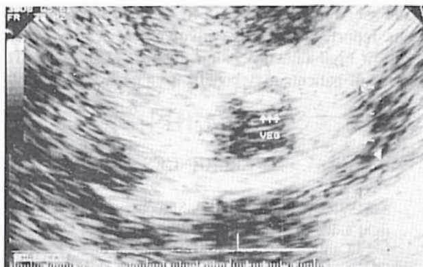
Fig. 1. Case no. 13: Vegetation at the ring of the aortic valve.

The introduction of echocardiography has made it possible to demonstrate vegetations in 75-80% of cases of IE. 9 Hence one would expect that the diagnosis of IE