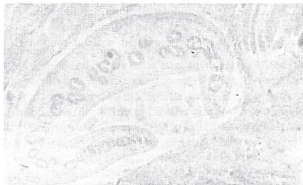
Fig. 2. Higher magnification of the parasite showing the spiny tegument (ST) and parenchymal cells (PC).