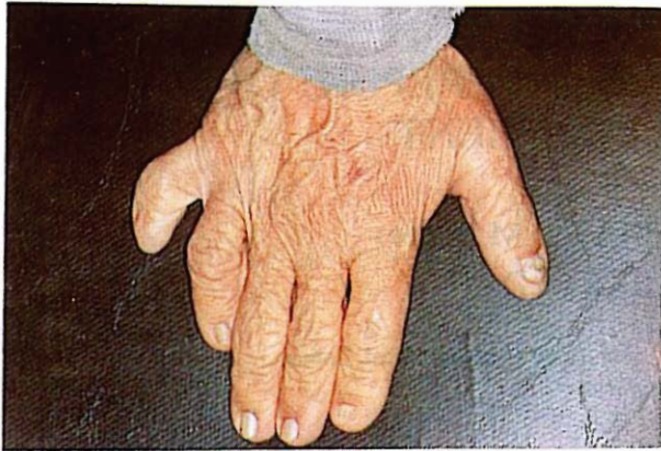
Fig. 1. Radiography of the hand shows six fingers and hypoplastic nails.