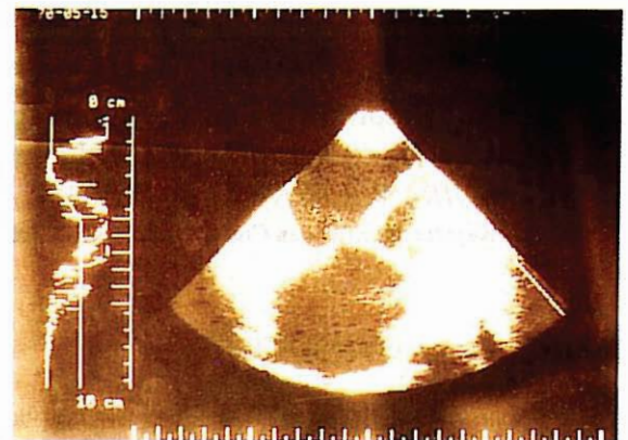
Fig. 4. Two-dimensional echocardiography, apical view, showing single atrium with two-chamber ventricle.

system, nails, and mouth are the most common. 1,2