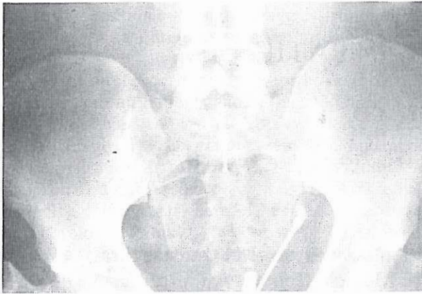
Fig. 1. Ureteral dilatation. with flexible metal dilator.