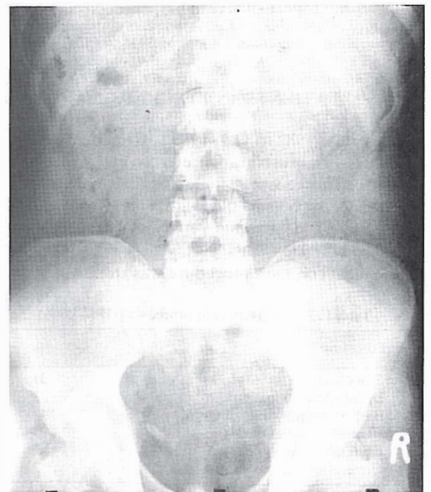
Fig.3. Plain film of one of the patients with ureteral stone (lower third).

Three patients underwent T.U.P. because of filling defects on IVP and in one case it was due to ureteral