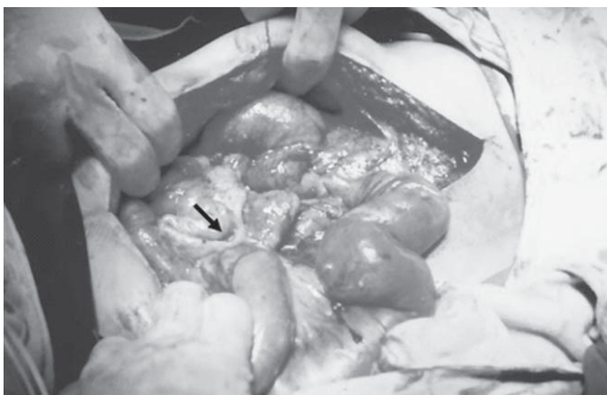
Fig. 3. Laparotomy findings; an obstructive band (black arrow), and dilated proximal loops (dashed arrows).

foration which is usually localized, free perforation and secondary bacterial peritonitis will ensue if unnecessary and additional procedures are performed [6,7,14].