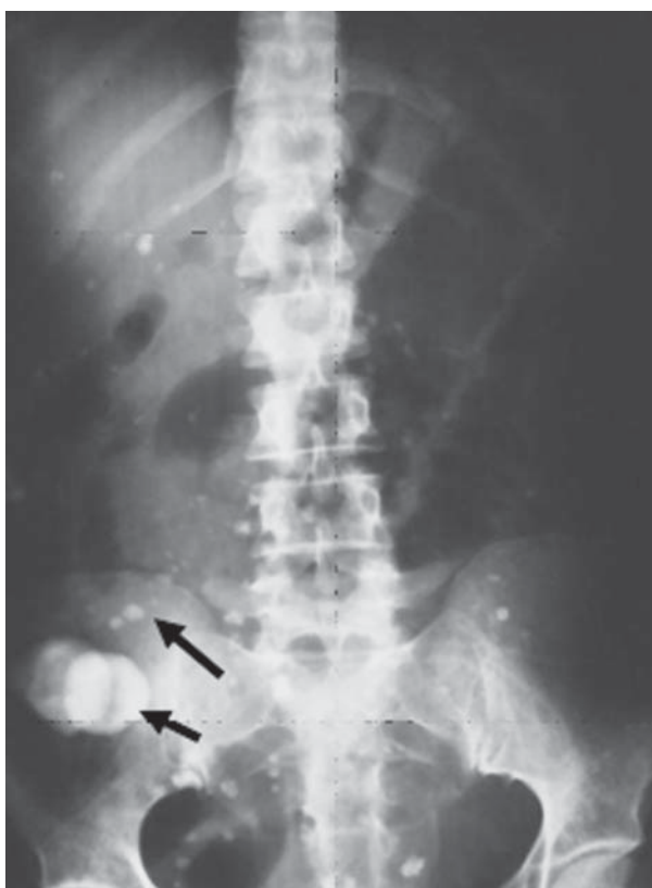
Fig. 1. plain Abdomen: Enteroliths (Black Arrow); Calcifications (Dashed Arrows).