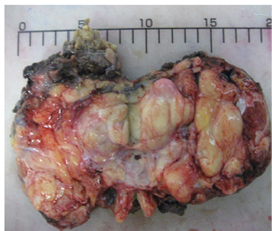
Fig. 4. Cut surface of case no.2 that is creamy yellow soft with areas of fish fleshy consistency. Cut surface of testis is also noted adjacent to it.

ing for a period of 7 months without any pain or lymphadenopathy. Physical examination showed an irregular and firm mass in superior portion of left testis. Clinical impression was testicular tumor. Laboratory tests including serum tumor markers were within normal limits. Ultrasound study revealed an echogeneous mass measuring 6.8x3.2 cm adjacent to left testis. MRI study, displayed two masses approximately 8x7 and 8x6 cm. The former was