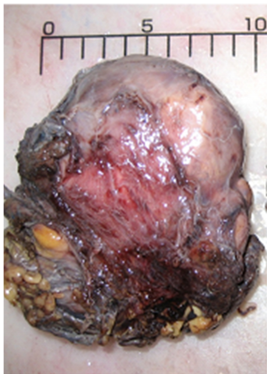
Fig. 3. External surface of hemiscrotal mass of case no.2.