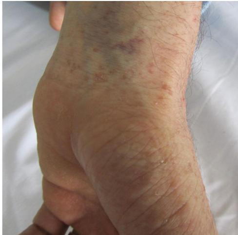
Fig.1. Maculo popular rashes on volar area of the pateint