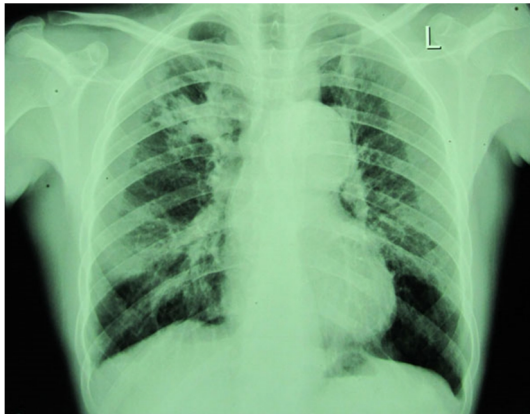
Fig.2. patient's chest X-ray