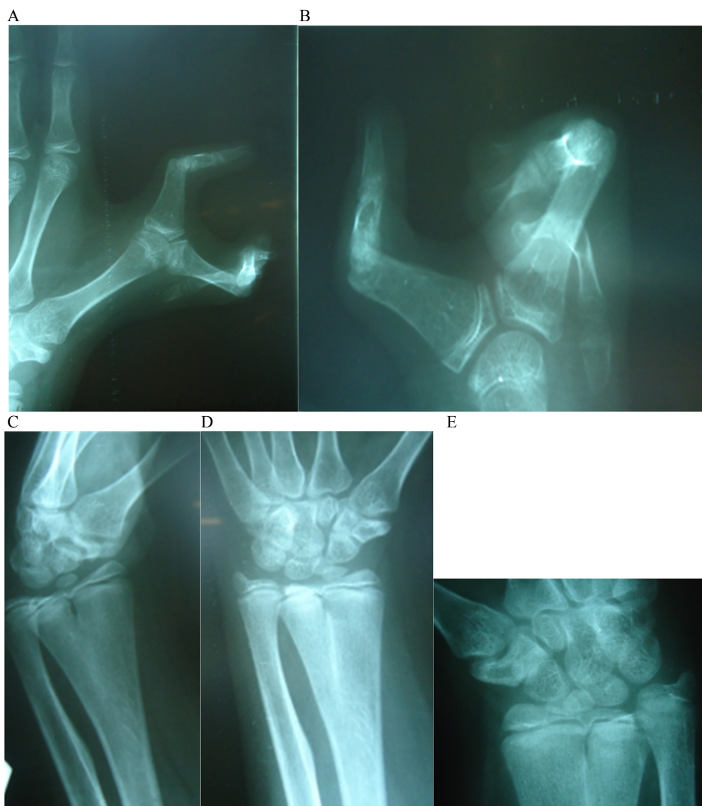
Fig. 2. A, Two main triphalangeal thumbs duplicated from the metacarpophalangeal joint. B, Attached to the radial main thumb are two hypoplastic branches, one from the metacarpal and the other from the distal interphalangeal joint. C, Bifurcation of radius bone. D, Duplicated trapezium, scaphoid and lunate bones. E, Ulnar lengthening relative to duplicated radius bone.