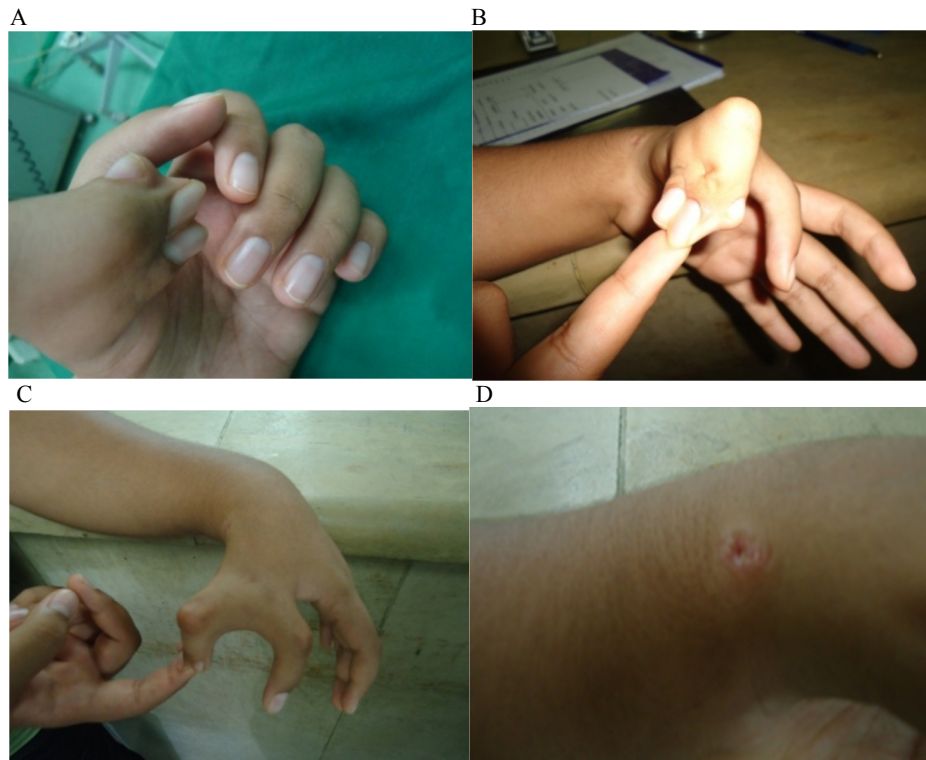
Fig. 1. A- Opposition of 3 radial thumbs, B- three radial thumbs in view, C- V shaped deformity of 4 thumbs, D- congenital sinus on radial side of wrist (base of thumb).

triphalaengeal component at the level of the metacarpophalangeal (MP) joint; type IVB, in which the triphalaengeal component is only on the radial side. Miura added type C to cover ulnar triphalaengeism(8). Wassel's type VII was divided to 4 subtypes by Wood (7). Types VII A, B, and C refer to ulnar, bilateral, and radial triphalaengeism, respectively. Type D refers to a central triphalaengeal deformity with a nontriphalaengeal hypoplastic digit on each side (known as triplication). We present an unusual case of radial polydactyly not covered by any of the aforementioned types.