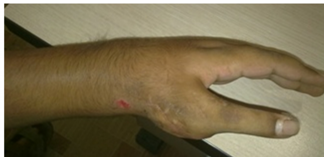
Fig. 4. The physical appearance of hand after operation.

pathogenesis of these malformations viewed as a spectrum of severity of embryonic events (11). Biphangeal duplicated thumb is usually unilateral, sporadic and resulted from developmental error can cause minor anterior SHH expression. Thumb triplication, radial polydactyly with triphalangism, and isolated triphalangism are the result of moderate anterior expression of SHH and are related to point mutation of ZRS on the 7q36 chromosome. In animal models, elevated levels of SHH in the radial aspect of the limb bud cause mirror hand or ulnar dimelia (12). In humans, there is a relationship between radial polydactyly and ZRS mutations.