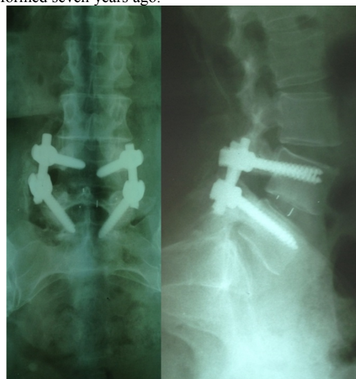
Fig. 2. Postoperative radiographs of the patient shown in Fig 1. Note that instrumented TLIF restored both intervertebral height and lumbar lordosis.