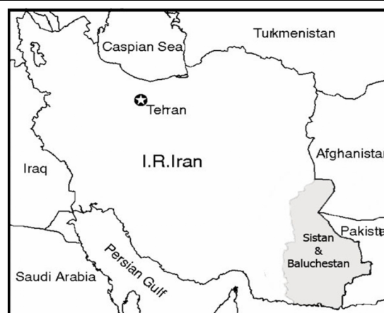
Fig. 1. Geographic situation of Sistan and Baluchestan, Iran

In Iran located in epidemiologic transition, cancer is the third cause of death after coronary heart disease, accidents and other factors (12-14). Incidence of cancer is increasing in developing countries because of aging and cancer associated lifestyle such as smoking, physical inactivity, obesity, and stress. The estimates predict that the number of new cases of cancer from 10 million per year in 2000 will rise to 15 million in 2020, and approximately 60% occurs in developing countries (15). Iran has experienced an increase in population in the