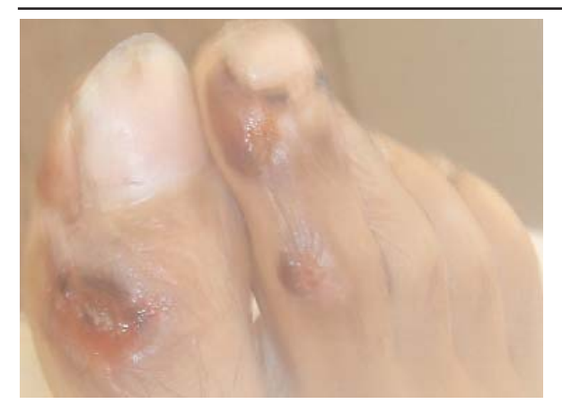
Fig. 3. Skin burns on the toes.

of intoxication similar to that produced by alcohol or marijuana. The effect usually lasts for only 15 to 30 minutes, but they can be sustained by continuous repeated use [7].