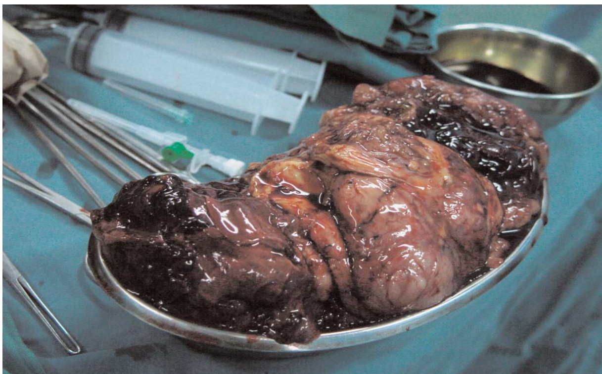
Fig. 3. Liver tissue after resection of the mass.

no wall enhancement in early and delayed phases of imaging. Bilateral pleural effusion with right side dominance was also noted. Free fluid and intra-abdominal LAP was not seen.