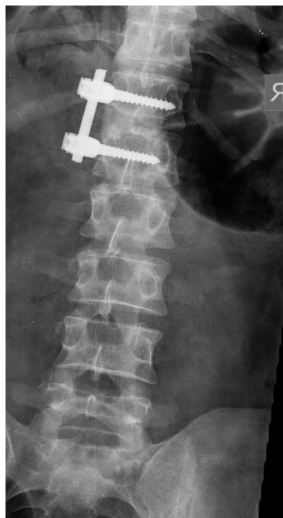
Fig. 3. Standard X-ray taken after discectomy and fusion by a left - thoracotomy

either side provoked right sided pain. Fine neurological examination revealed a band of slight hyposthesia in the T10 level, approximately. In the lower extremity, there was a doubtful increase in the knee and ankle jerk; great toe flexion and extension and ankle dorsiflexion power was Grade 3, 3, and 4, respectively, out of 5. No pathological reflexes like babanski were observed. Standard x-rays of thoracolumbar area were normal. EMG-NCV showed some dysfunction in the pathway of L5 and S1 roots. MRI demon-