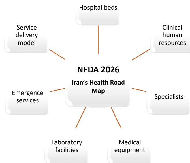
Fig. 1. Iran's National Health Roadmap Components

and economically viable expansion of hospital beds is the first step in the decision-making process to expand other expensive resources of the health system (5).