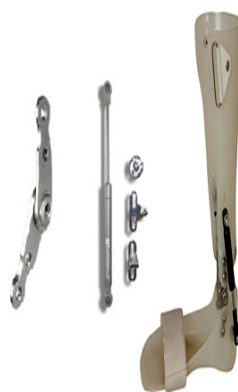
Fig. 1. The hydra pneumatic AFO

For all conditions, the following parameters were recorded: cadence (steps/min), stride length (m), step width (m),