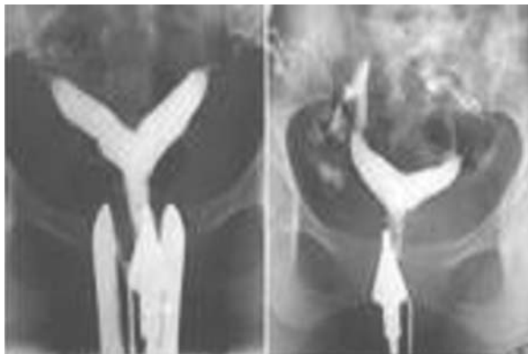
Fig. 1. Left: before operation; right: after operation.